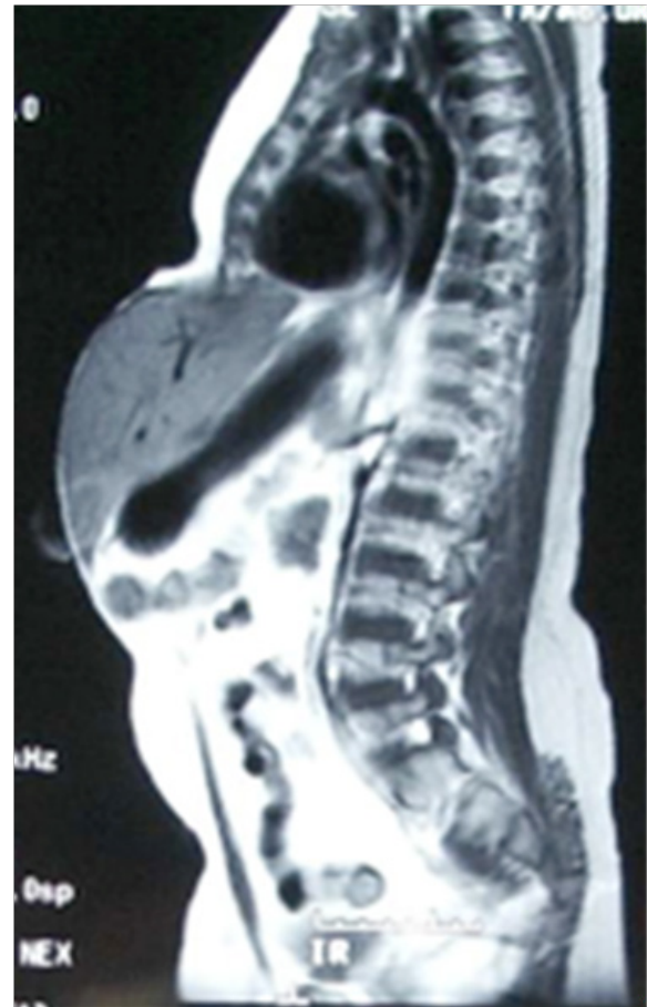
Figure 2 Abdominal MRI showing liver and stomach partially herniated through the abdominal wall defect