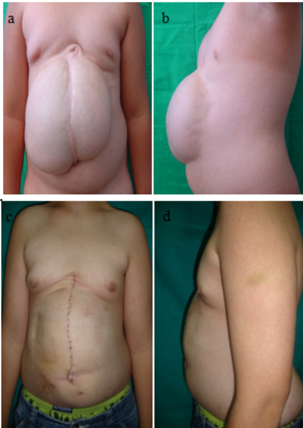
Figure 1 Anterior (A) and lateral (B) view of preoperative abdominal wall defect. Result of surgical correction of abdominal defect; anterior (C) and lateral (D) views