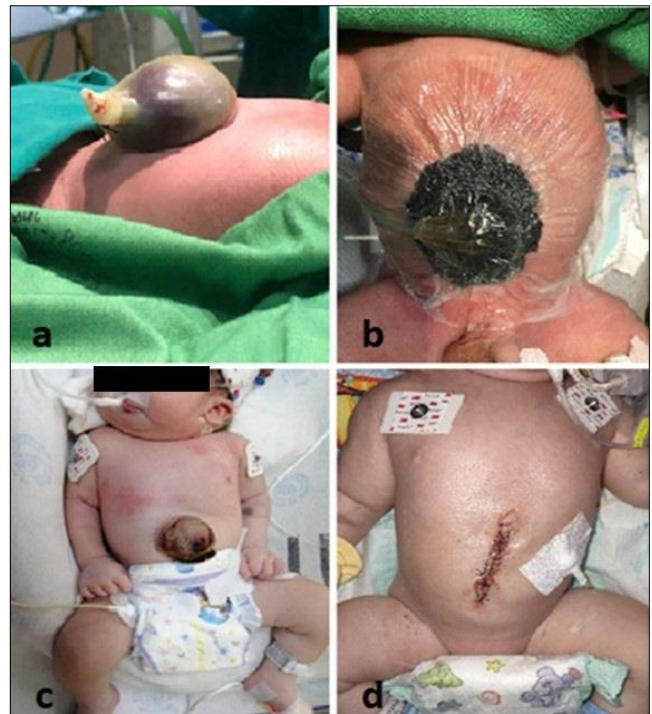
Figure 2: a) Omphalocele with liver herniation. b) NPWT system placement on 1st day of life. c) NPWT removal on the 9th day of life. d) Closure of the abdominal wall on the 16th day of life.

left vascular pulmonary hyper-resistance. Mechanical ventilation was required for 7 days, during that period bowel movements were present. On the 9th day, NPWT was removed, a total reduction of the omphalocele was observed (Fig. 2c). The closure was performed a week after due to cardiac instability (Fig. 2d). The patient was discharged at 1 month of age.