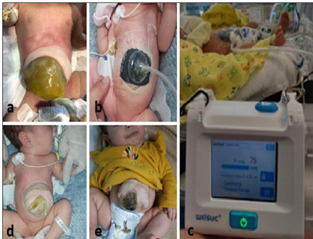
Figure 1: a) Giant omphalocele with herniation of liver, intestine and stomach. b) NPWT placement. c) welsuc® system, used in all patients. d) Defect size reduction due to amnios contraction, seen at day 20. e) Amnios scarification 9 days after NPWT removal.

Case 1: A female newborn weighing 2622g was born by C-section at 38 weeks of gestation to a 24-year-old primigravida with a prenatal diagnosis of omphalocele. The APGAR scores were 7-8-8. On examination, a giant omphalocele was seen with liver, stomach, and intestine as the contents of the sac (Fig. 1a). NPWT was placed using a continuous pressure of 100 mmHg (Fig. 1b,c). The patient developed severe pulmonary hypertension, which warranted high-frequency mechanical ventilation, pseudo-relaxation, and administration of a selective pulmonary vasodilator. Improvement was seen on her 7th day of life. Pressures on the NPWT were as high as 175 mmHg with good tolerance. On the 8th day, the NPWT system replacement was performed. Reduction of the defect size was observed (Fig. 1d). The device was set on 100 mmHg of pressure, which progressed to 125. Enteral stimulation was started. On the 20th day of life NPWT was removed, amnios contraction was observed (Fig. 1e). Two (2)% Hydroalcoholic Chlorhexidine was used as part of treatment to aid in scarification. On the 29th day, the patient showed good enteral tolerance and adequate bowel movements so she was discharged.